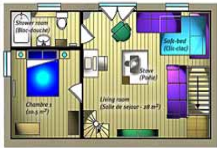
LA GRANGE - LEVEL 2